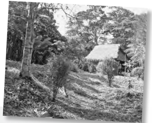
Existing structure to be removed from La Torre land. Phase I planned for construction on the same site.

Please visit www.heartofthehealer.org to make a donation towards the stewardship of this precious land.